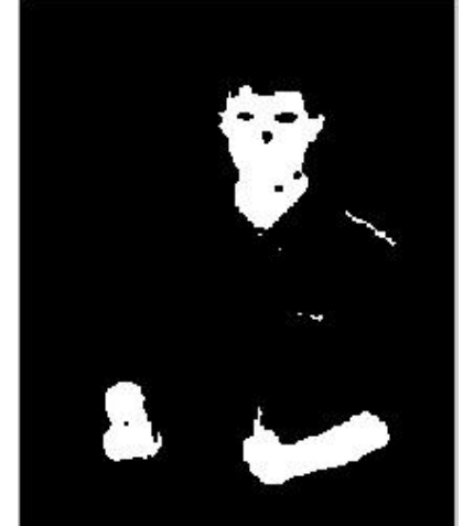
Figure 2 Result after morphological filtering

The command imfill fills holes in the binary input image inp and produces the output image outp. Applying this operation allowed the missing pixels of the detected face regions to be filled in. Thus, it made each face region appear as one connected region.