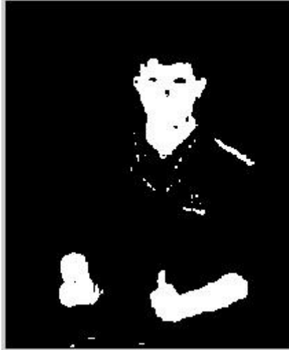
Figure 1 Result after thresholding

As seen in fig 2, the blue channel had the least contribution to human skin color. Leaving out the blue channel would have little impact on thresholding and skin filtering. This also implies the insignificance of the V component in the YUV format. Therefore, the skin detection algorithm using here was based on the U component only. Applying the suggested threshold for the U component would produce a binary image with raw segmentation result, as depicted in fig 1.